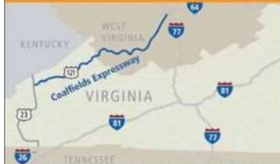
Information on CFX in Virginia Department of Transportation website www.vdot.state.va.us/projects/infrastructure/coalfields_expressway.asp

MORE INFORMATION ON THE PROPOSED VIRGINIA COALFIELDS EXPRESSWAY. USE THE QR CODE.