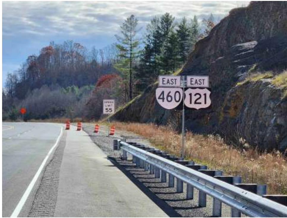
The first 2.57 miles of the Coalfields Expressway (U.S. 121) in Virginia are now open!!!